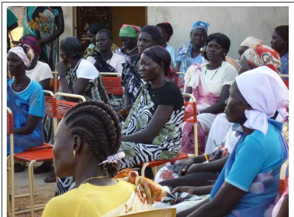
Local women attending a meeting organised by the Sisters at Wadakona